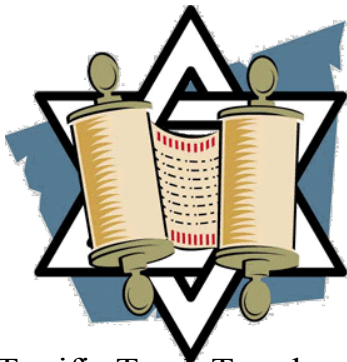
Terrific Torah Tuesday